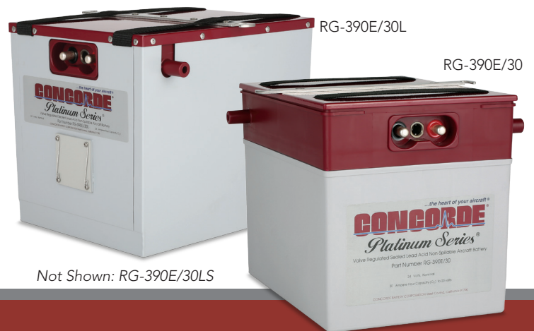
Not Shown: RG-390E/30LS

Manufacturing certified aircraft batteries for over 40 years: Military, TSO, FAA-PMA, OEM